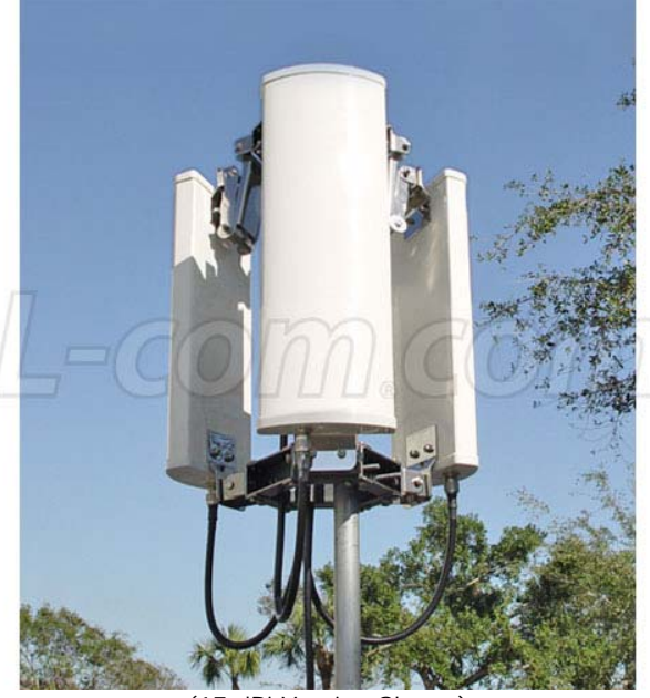
(17 dBi Version Shown)