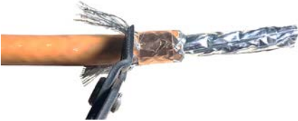
③.paste copper foil on the braided and ground wire and cut off the excess weave and the ground wire