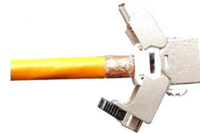
⑧.install the termination cap in direction of arrow into the keystone jack