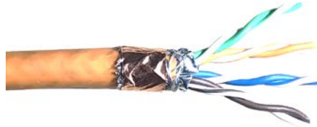
④.4.Fan out all four twisted pairs, allocate each by following colorcoding label