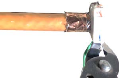
⑦.Trim the theends of conductors.