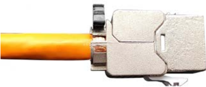
⑨.press both covers of the keystone jack to contact the cable