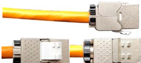
⑩.Fasten smart cable ties for 360 degree shielding