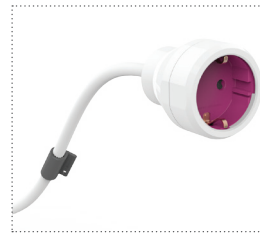
PowerExtension 5m [DE]