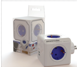
Original USB + rib [DE] 2