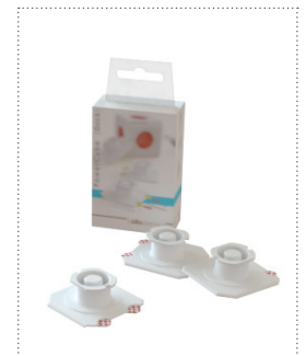
Docks 3pcs [EU]