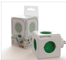
Original + rib [DE] 2