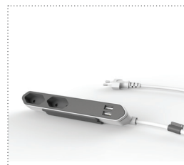
PowerBar USB [EU]