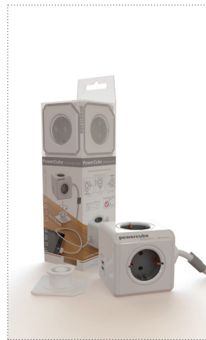
Extended USB [DE]