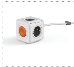
PowerCube Remote Extended [DE]