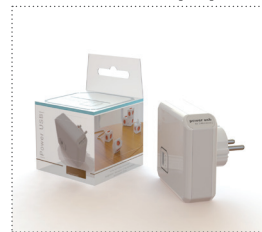
Power USB [EU]