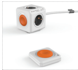
PowerCube Remote Extended + PowerRemote [DE]