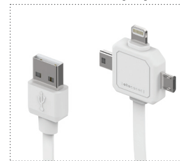
Power USB Cable