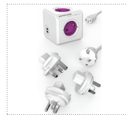
ReWireable USB + 3x Plugs + IEC Cable [DE]