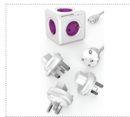
ReWireable + 3x Plugs + IEC Cable [DE]