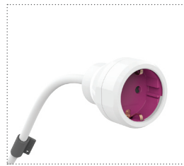
PowerExtension 3m [DE]