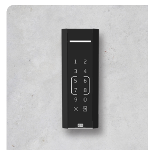
2N® ACCESS UNIT M TOUCH KEYPAD & RFID, NFC