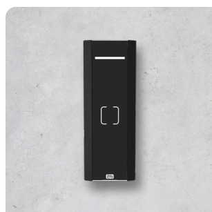
2N® ACCESS UNIT M RFID 13.56 MHz, NFC