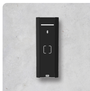
2N® ACCESS UNIT M BLUETOOTH & RFID, NFC