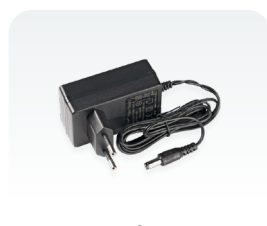
24 V 1.2 A power adapter