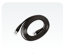
UTP Flat Cable (1.5m)