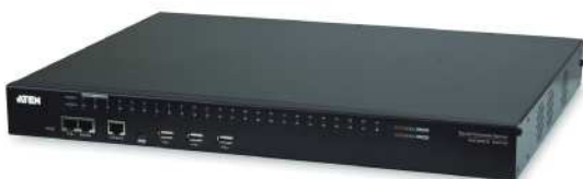
SN0148 Front View