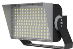
light shield als Zubehör erhältlich