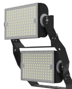
connection brackets als Zubehör erhältlich