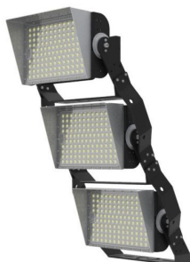
brackets und shield als Zubehör erhältlich