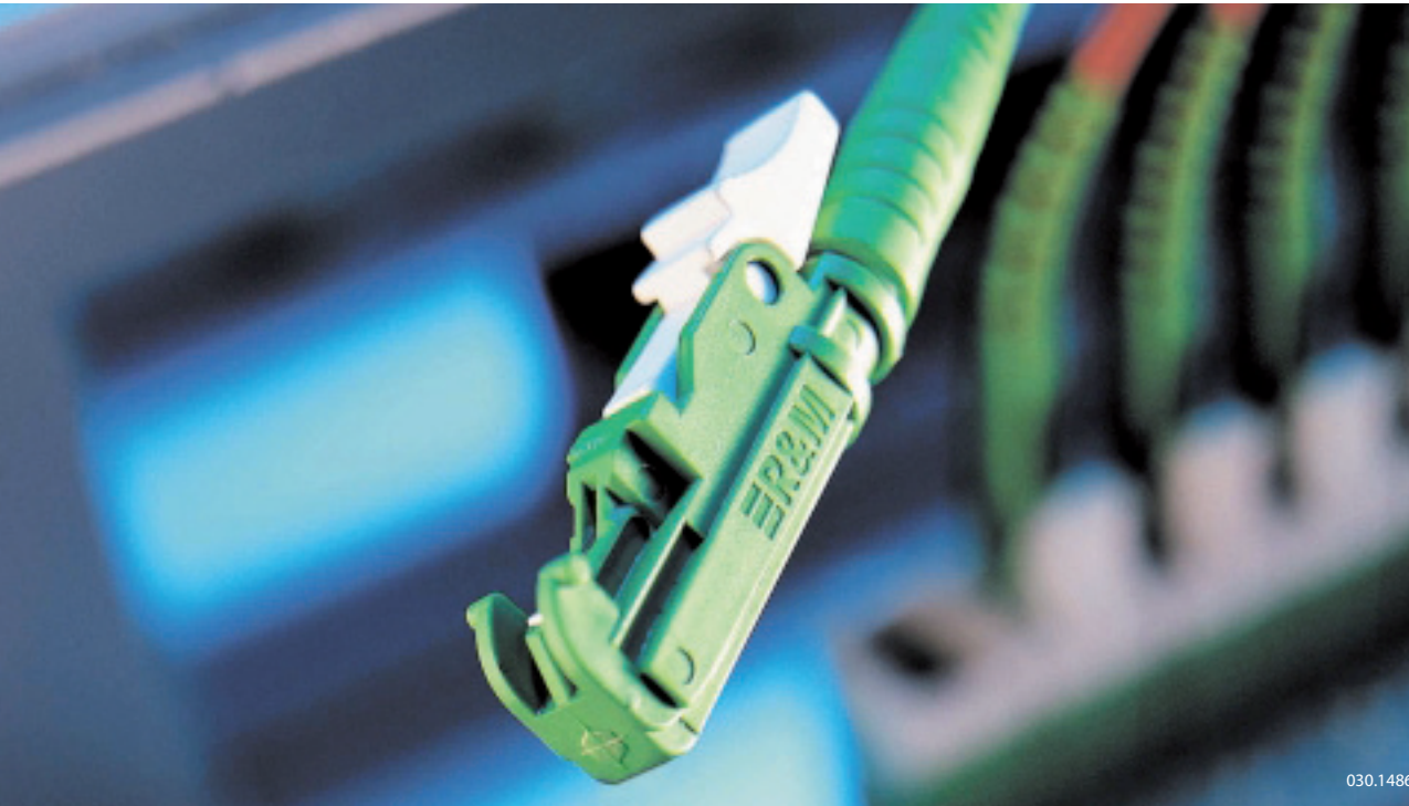
R&M Connector E-2000™