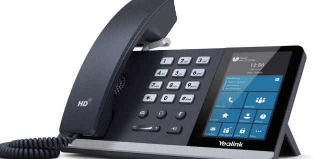
4.3-inch Multitouch Screen